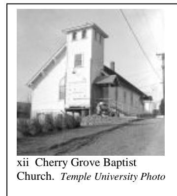
xii Cherry Grove Baptist Church.