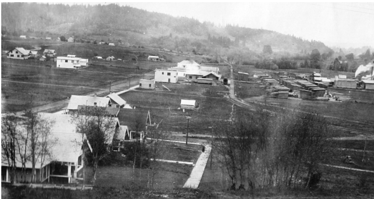
xiv Looking East in Cherry Grove at downtown, with Lovegren Mill on the right, and railroad heading towards Gaston.