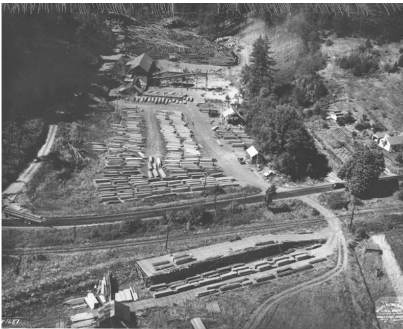
xvii Olson Lumber Company in about 1950 in Scoggins Valley.